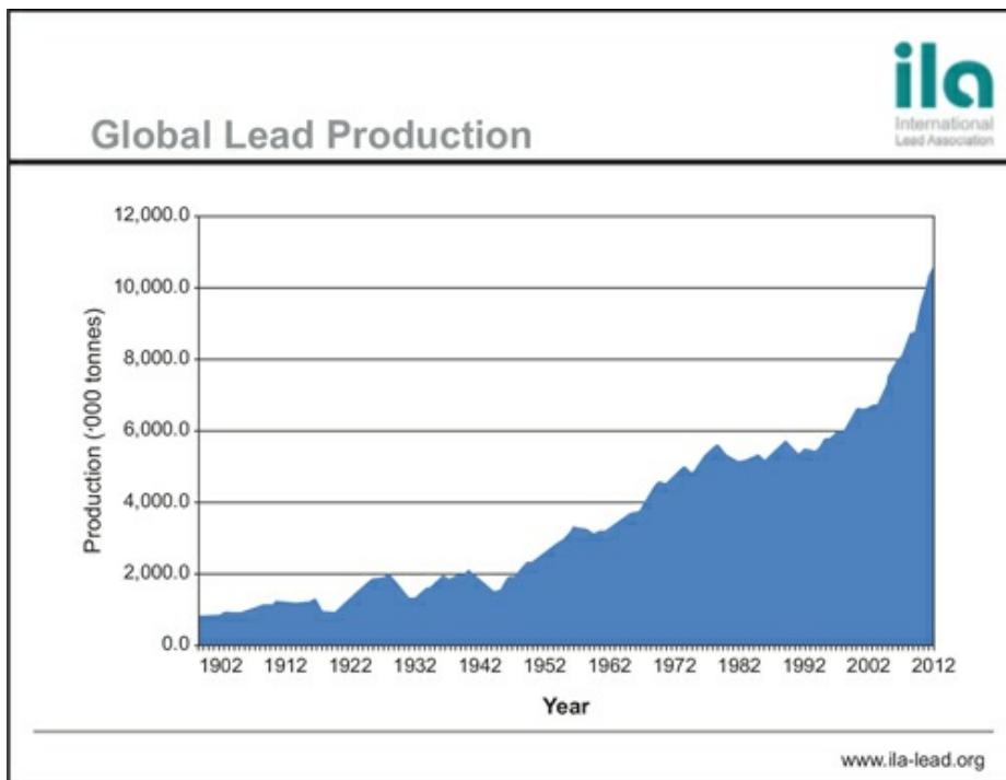
Figure 1: International Lead Association, 14 th Asian Battery Conference, Hyderabad, India 2013

Lead is integral for LABs. LABs are the primary use of all lead produced in the world, and recycled LABs are the primary source of all lead production. According to the ILA, in 2012 the manufacture of LABs accounted for approximately 85% of all lead produced worldwide. In addition, the ILA reports that 57% of lead production worldwide was from recycled LABs. The integral and cyclical relationship between lead and LABs is the result of several important factors, including: